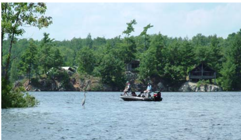
Blue Heron Waiting for Fisherman's Catch