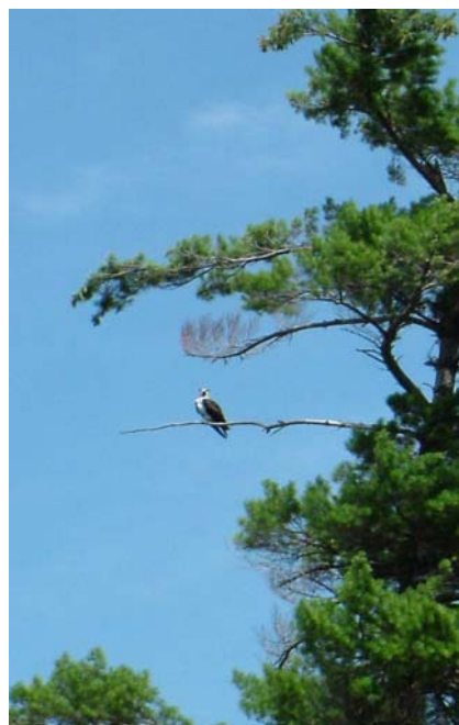
Osprey Guarding Nest