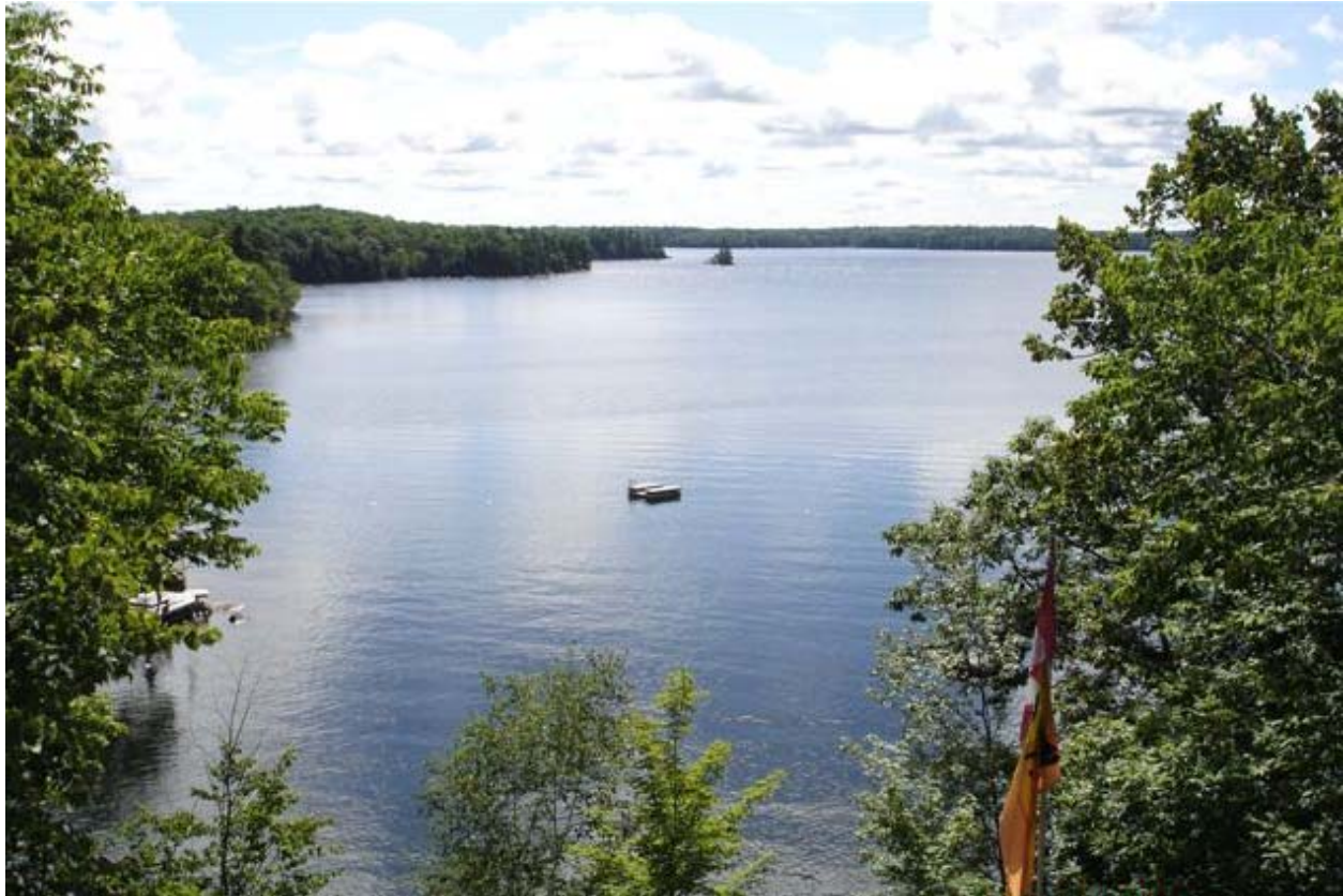
View of West Basin of Bobs Lake