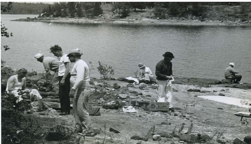
Parr Island Bobs Lake.....shore fish fry "the old days"